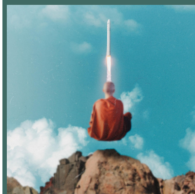
MEDITATE IN DISCOMFORT (MINI ALBUM) [2017]