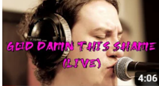
GOD DAMN THIS SHAME (LIVE)