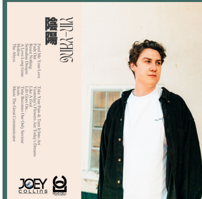
YIN-YANG (DEBUT ALBUM) [2023]