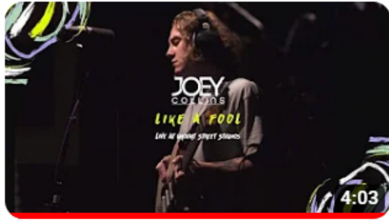
LIKE A FOOL (LIVE)